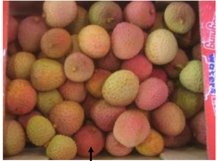
Litchis from South Africa, big in size but of mixed colour and aspect.