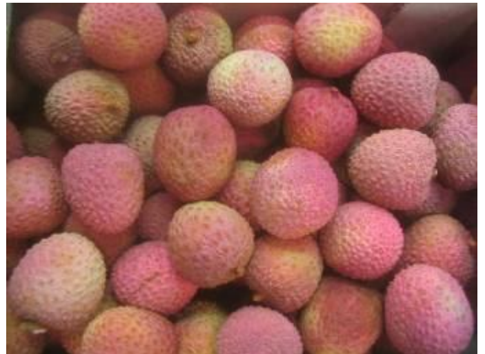
Litchis from South Africa more attractive in colour.