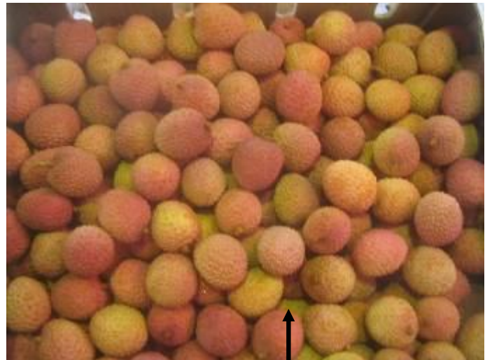
Litchis from Madagascar of standard quality. Mixed in colour and of dull aspect.