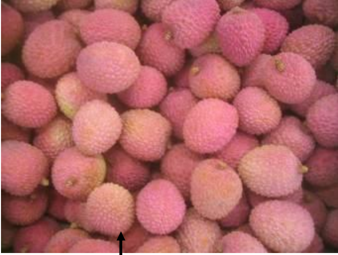
Litchis from Madagascar of good quality and attractive in colour.