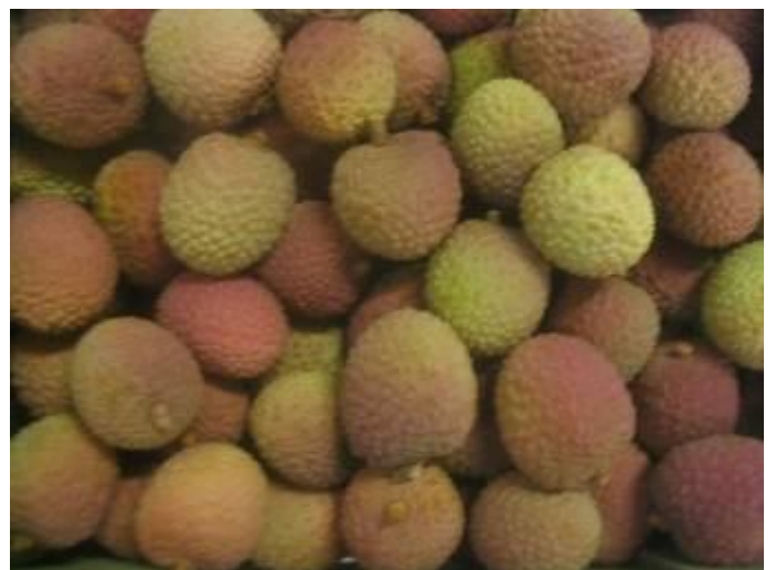
« Sae freighted » litchis from South Africa of size XL. Not of very attractive colour.