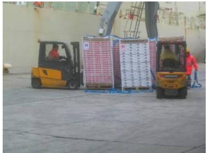
Unloading of the vessel.