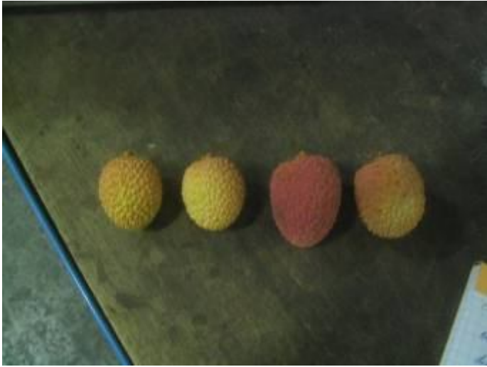
Differences in size and in colour.