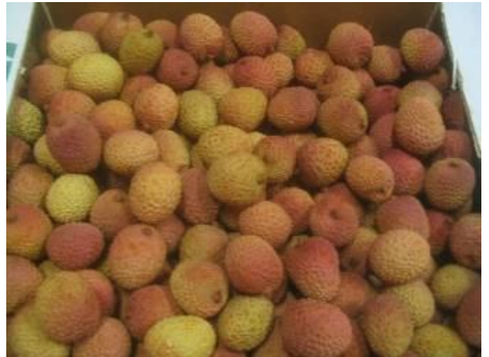
Fruits of standard quality.