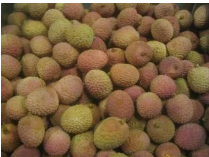
Fruits dull in aspect