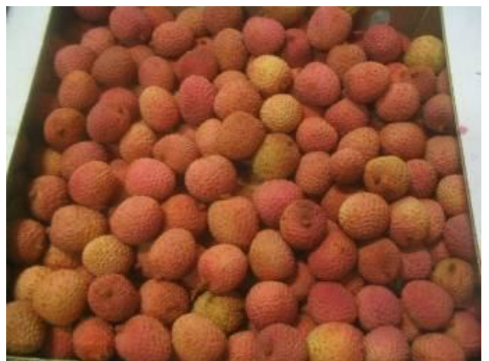
Litchis unloaded from the Hansa Bremen. Satisfactory quality of the fruits, with differences in size and sometimes with high coloured fruits.