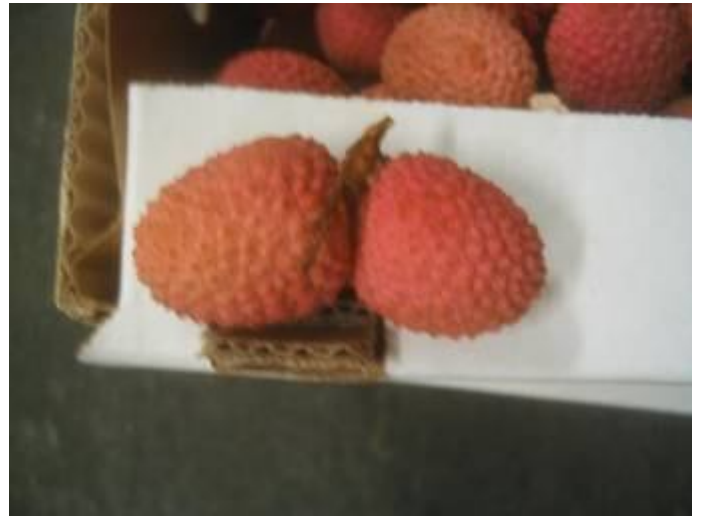
Twin fruits with long peduncles.