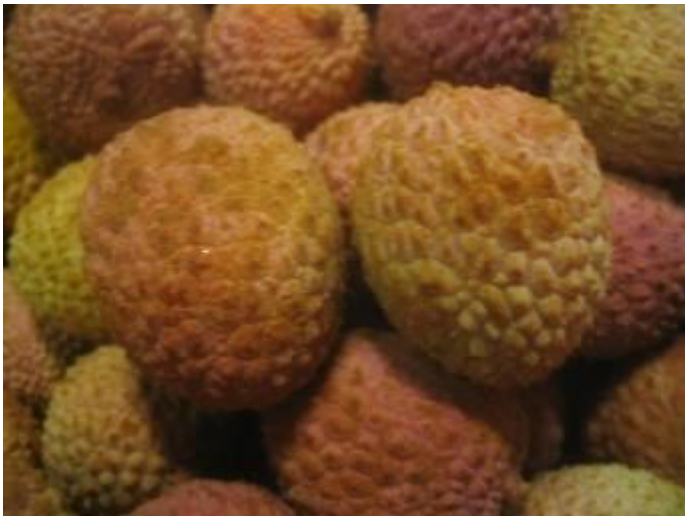
Burns due to sulphur.