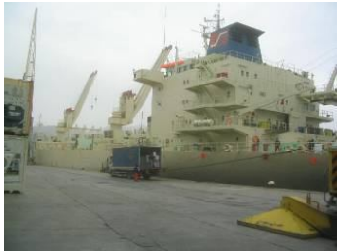
Unloading of « Hansa Bremen » at Genoa