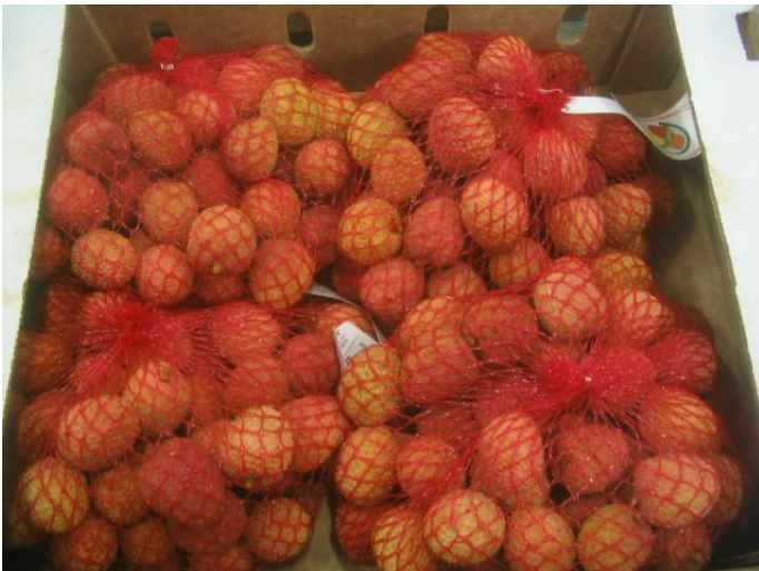
Litchis from Madagascar presented in 500g net bags to be sold in supermarkets