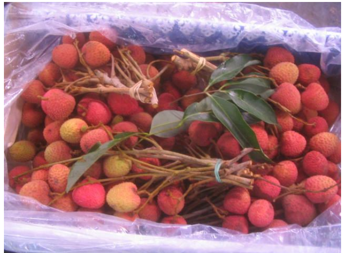
On stem litchis from the Reunion presented in bunch.