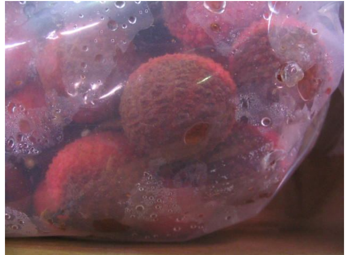
On stem litchis from Madagascar packed in non adapted plastic bags. Oxidation of fruits occur rather rapidly.