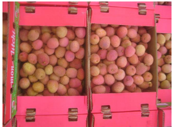
« Sea freighted » litchis of Madagascar of standard quality.