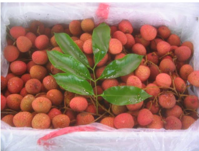
On stem litchis from Mauritius. Some fruits with stains.