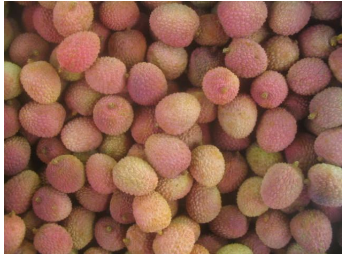
Sea freighted litchis from Madagascar of mixed quality (size, colour, dull aspect)