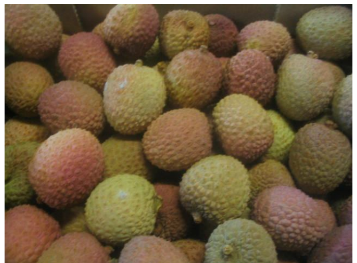
Litchis from South Africa, mixed in colour and sometimes not very attractive. Some mould stains observed on some lots seen on the market.