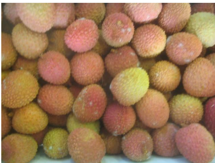
Litchis from Madagascar presenting some mould stains. Marginal signs observed on the end of some lots.