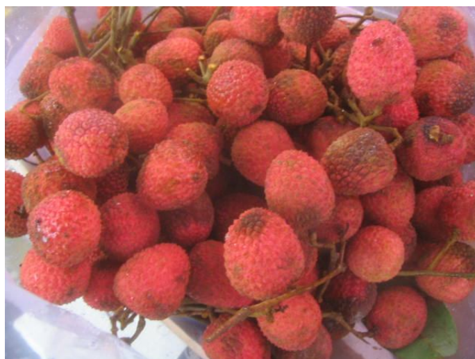
On stem litchis from Madagascar. Good colour and taste but with rapid signs of oxidation on the shell of fruits.