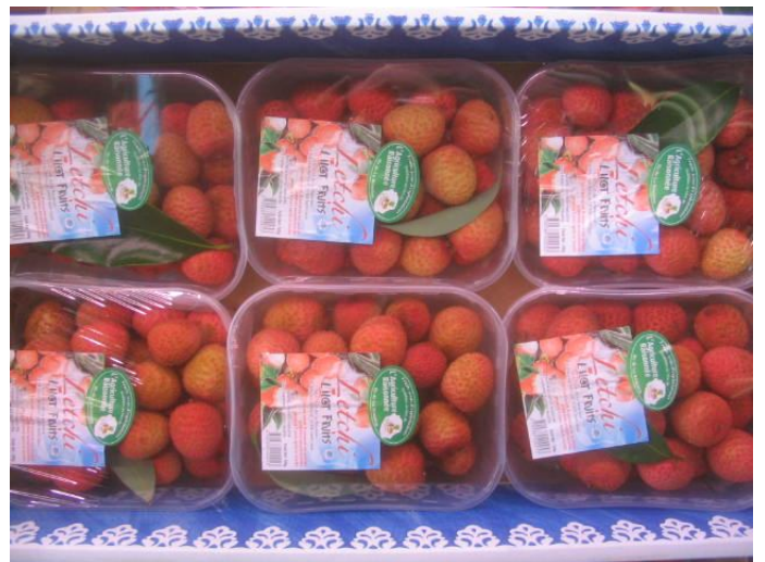
Litchis from the Reunion presented in bunch or in punnets. Satisfactory quality.