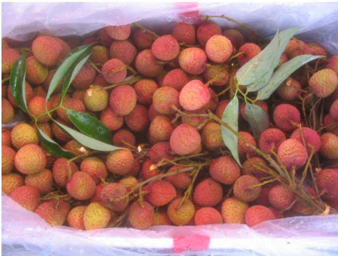
On stem litchis from Mauritius of good quality but mixed in colour.