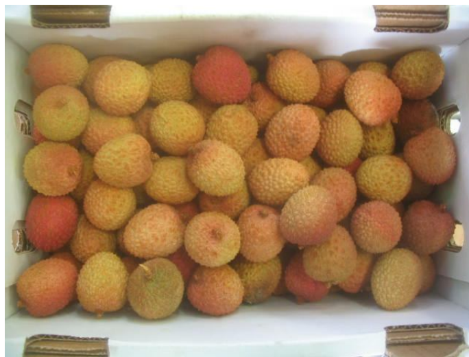
Litchis from Madagascar of standard quality. Fruits limited in size and of mixed colour