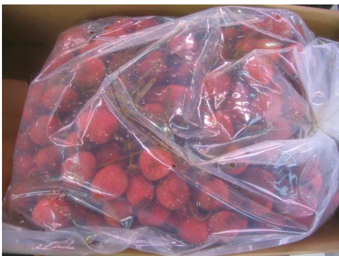
On stem litchis from Madagascar. Plastic packaging not very adapted.