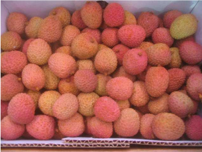
Litchis from Madagascar. Fruits of sizes 27/31mm. Good colour.