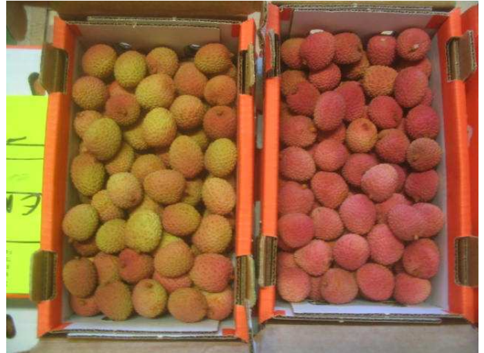
Litchis from Madagascar mixed in colour.