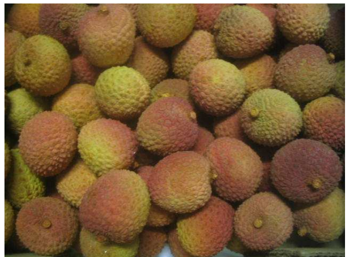
Litchis from South Africa big in size (XXL) but not attractive in terms of colour.