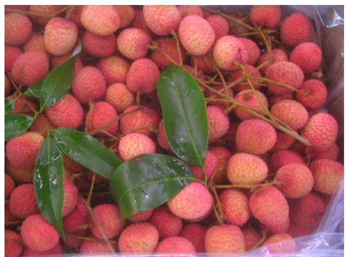
On stem litchis from Mauritius, Colour of fruits differs according to lots.