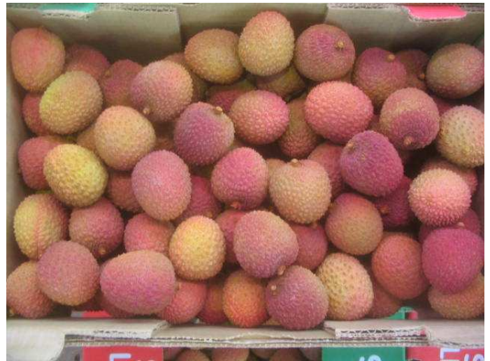
Litchis from South Africa mixed in colour but of good eating quality.