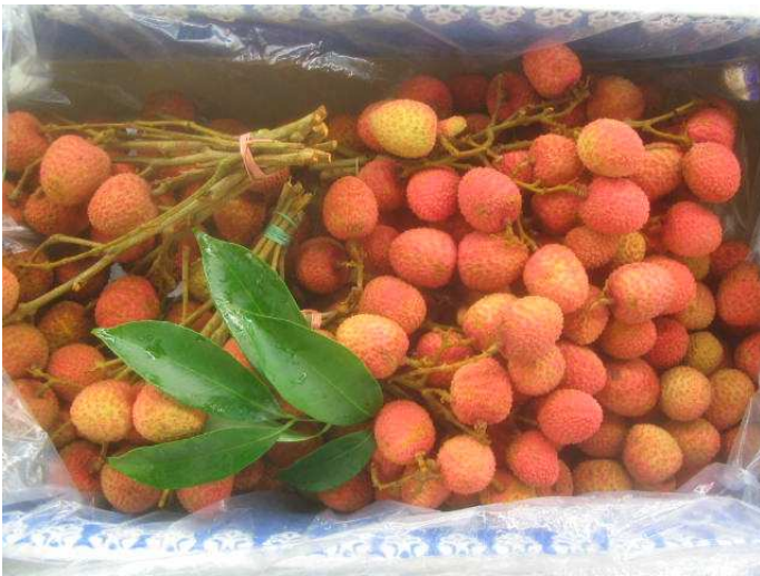
Litchis from the Reunion presented in bunch.