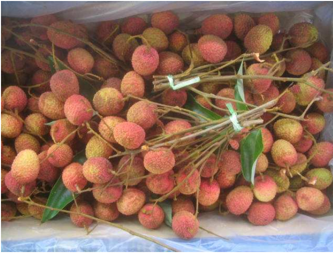
On stem litchis from Mauritius presented in bunch.