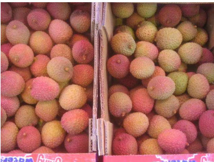
Litchis from South Africa mixed in size.