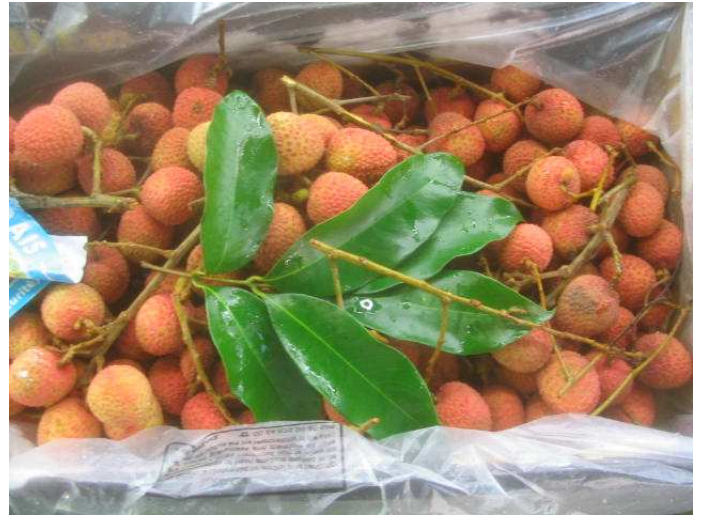
On stem litchis from the Reunion.