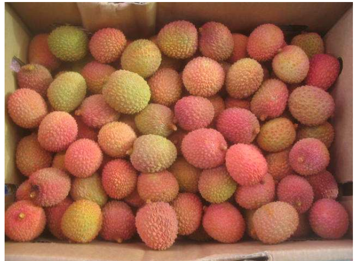
Litchis from Mauritius mixed in colour and in size.