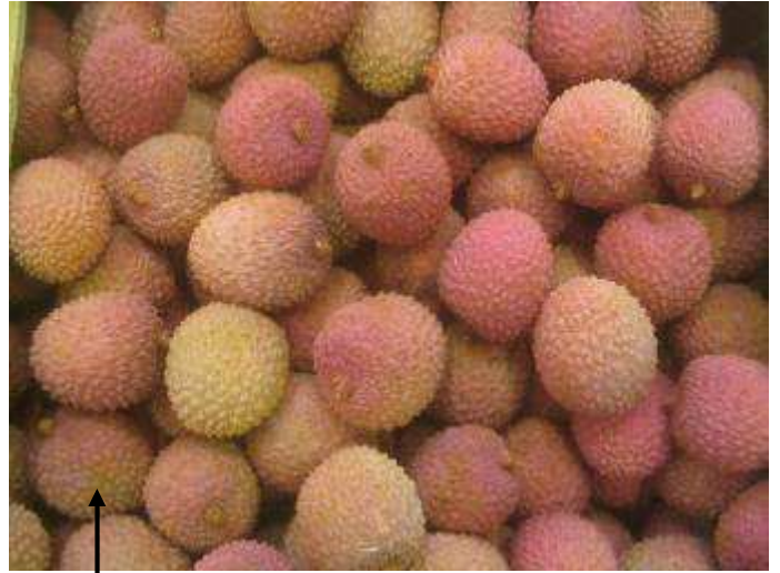
Old litchis, presenting more and more defects (shell indurations, loss of colour, smashed fruits, etc.)