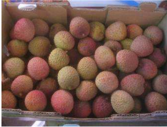
Standard quality litchis of the Mauritius variety