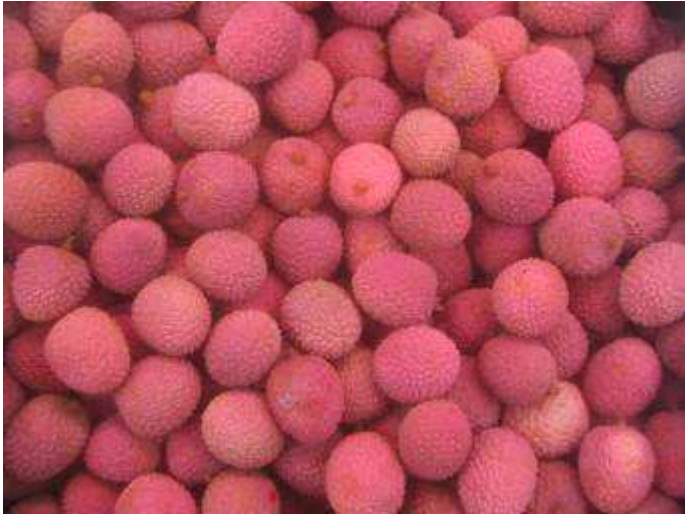
Litchis of standard quality presenting rather good colour