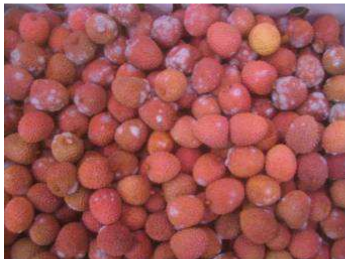
Important traces of mould