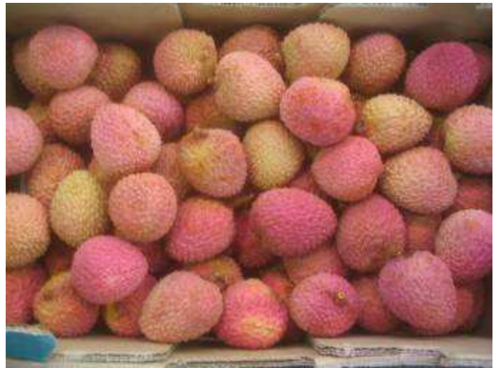
Litchis of the Red Mc Lean variety, mixed in colour but fresh fruits