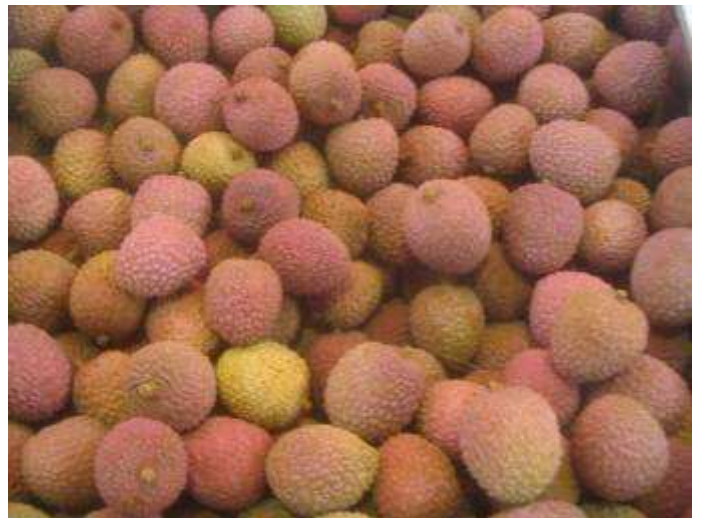
Old fruits (dried shells dull in aspect, squashed fruits, and development of mould)