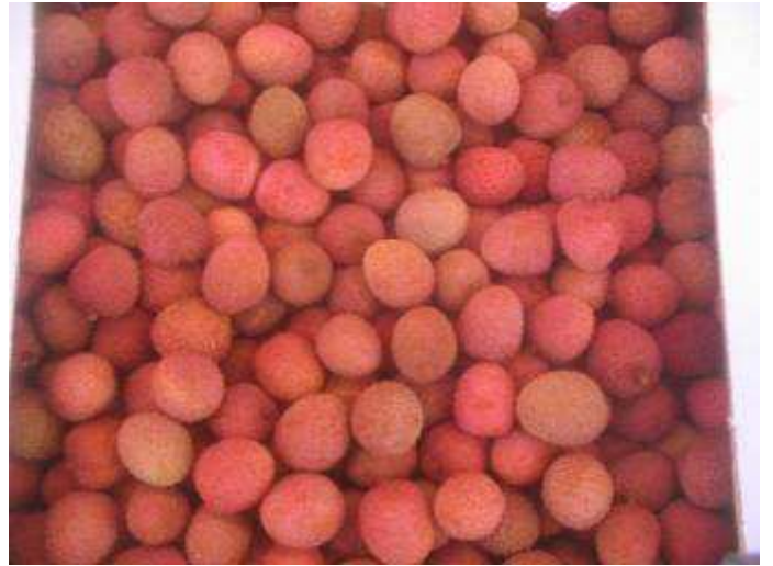
Litchis of good colour and aspect but presenting signs of old fruits (shell indurations soft fruits etc)