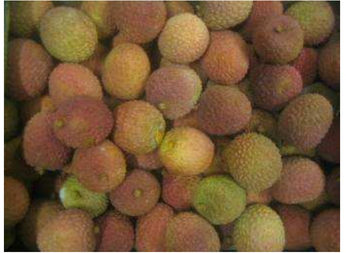
Fruits mixed in colour. Dried shells and development of mould