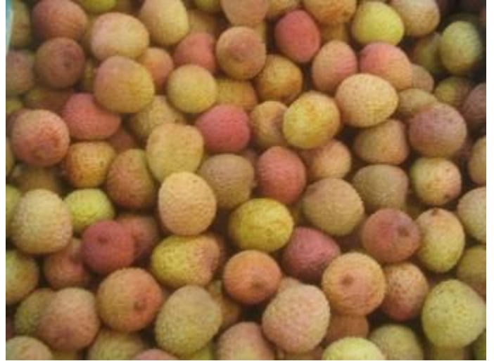
Litchis of average quality. Not so attractive in colour.