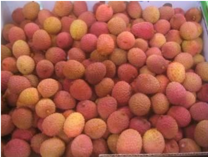
Litchis of standard quality