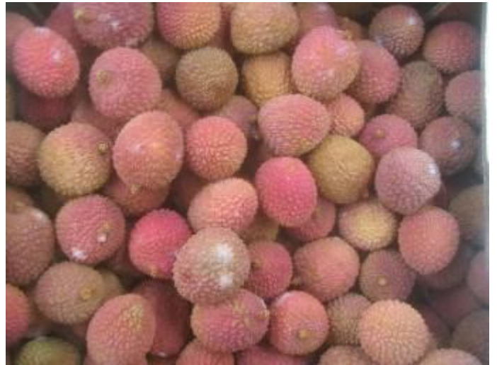
Development of mould.