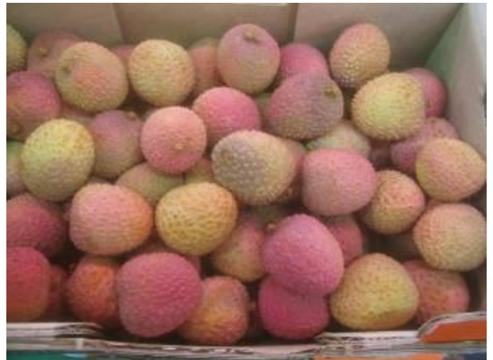
Paled coloured fruits. Fruits presenting some stains.