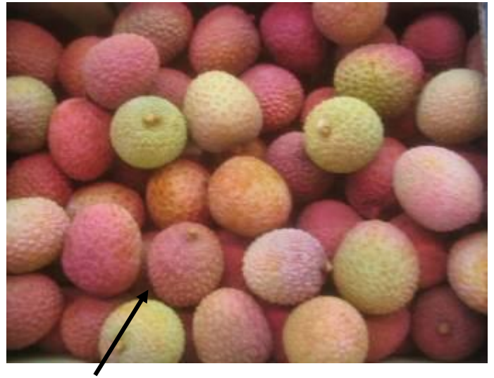
Litchis of standard quality presenting some differences in colour. Some soft fruits.