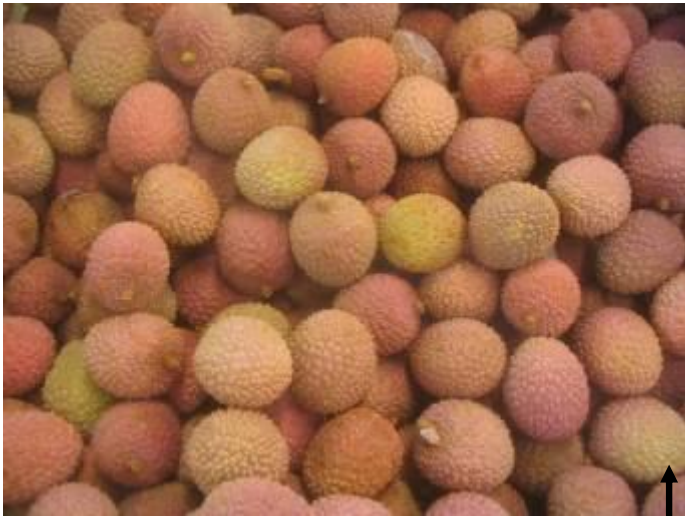
Old Litchis. Fruits are dull in aspect with progressive indurations of the shells.