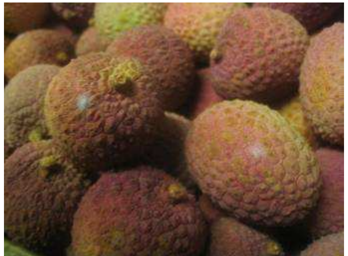
Little mould stains and poor coloured fruits.