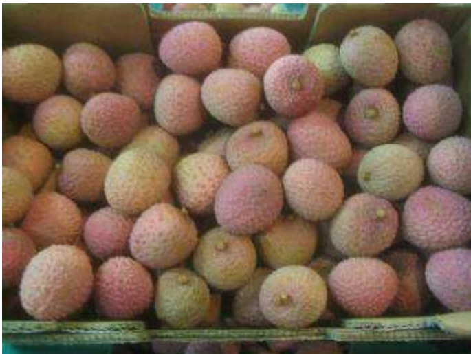
Poor coloured litchis