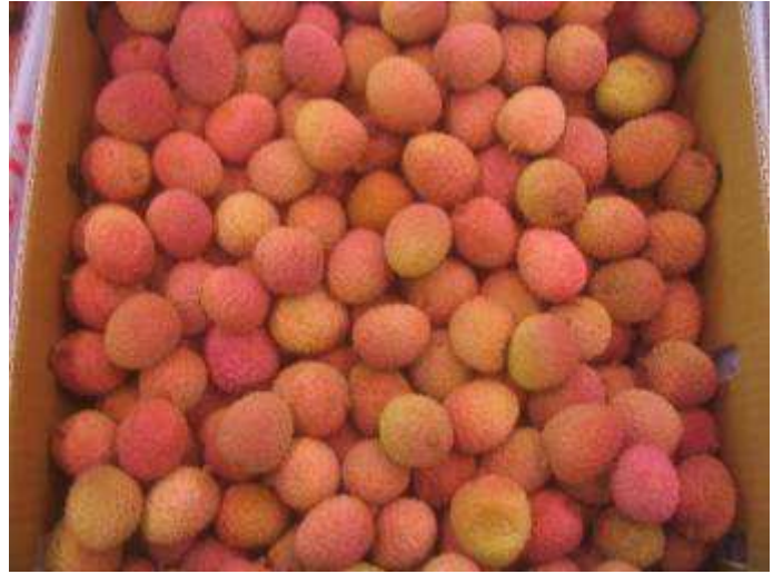
Fresh litchis presenting good colours