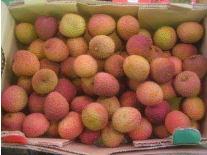
Litchis of satisfactory quality in terms of colour, size and freshness.