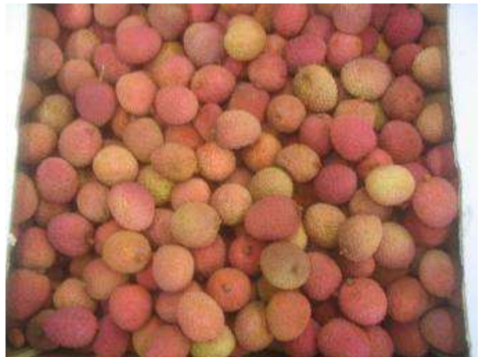
Old litchis, dull in aspect. Shell indurations are in progress with/or without softening fruits