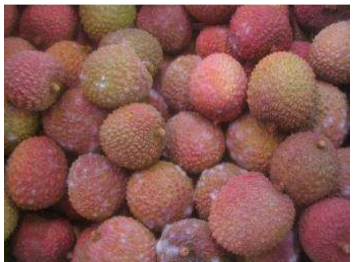
Litchis with mould stains.