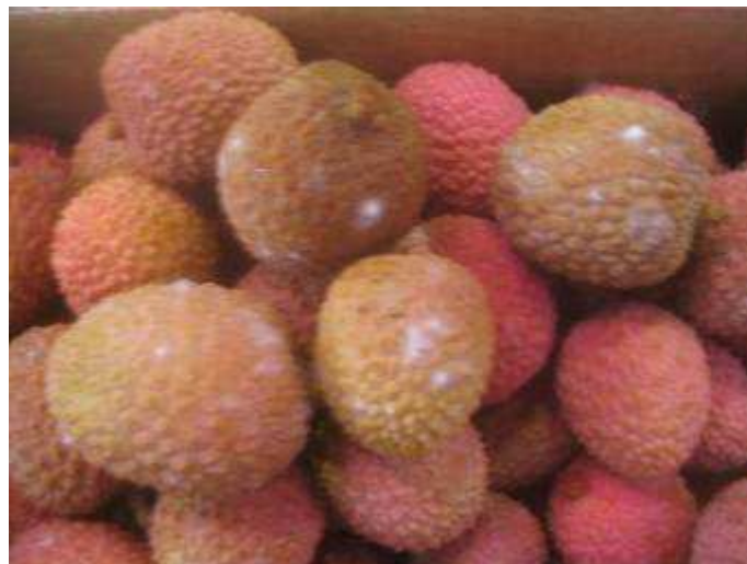
Litchis with scattered mould stains.