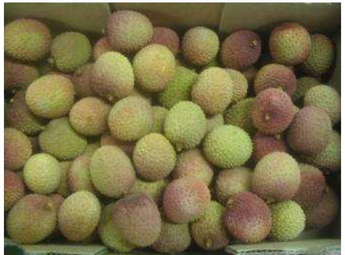
Litchis of poor attractive colour.