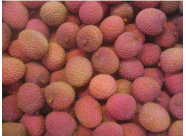
Litchis of satisfactory quality. Shell is still supple with attractive colour