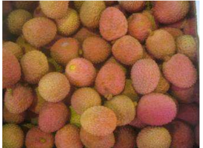
Ageing litchis. Fruits are more and more dull in aspect. Some soft and squashed fruits. Fruits are mixed in colour. Progressive indurations of the shell.