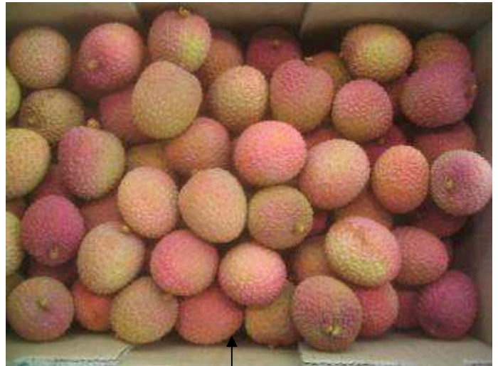
Litchis of satisfactory quality, good colour and size.