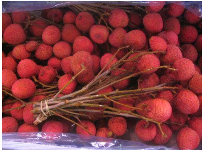
Litchis from Reunion of good colour and size.