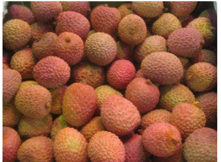
Litchis from Madagascar of standard quality. Mixed sized fruits.