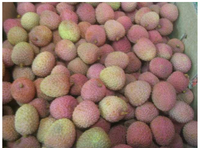
Litchis from Madagascar dull in appearance. Ageing fruits. Beginning of indurations of the shell.