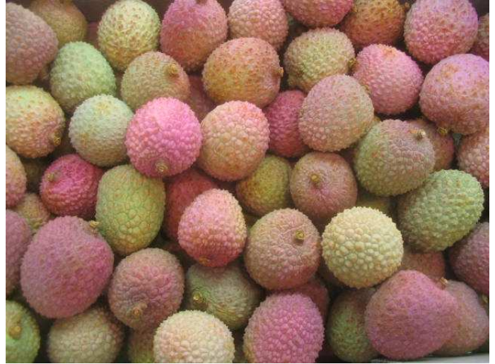
Litchis from South Africa mixed in colour and in size.