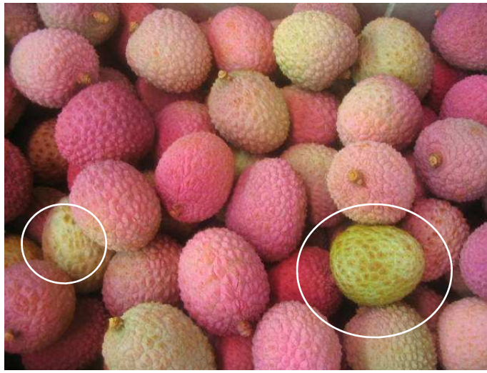
Litchis from Madagascar mixed in size and colour. Fresh fruits in appearance. Some fruits presenting some sulphur burns.