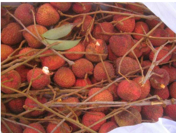
On stem litchis from Reunion with oxidation stains. Depreciated goods.