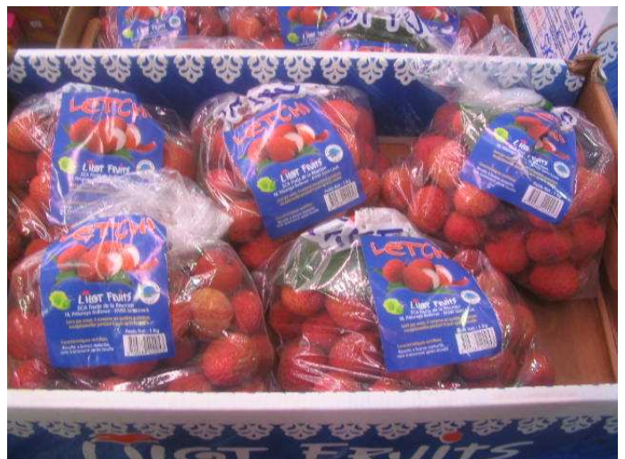
Litchis from Reunion in plastic bags of 1kg Good quality fruits.