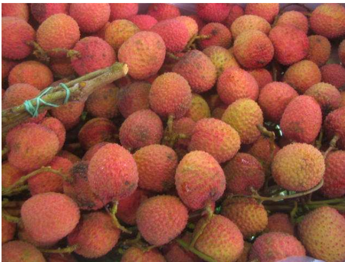
Litchis from Mauritius in bunch, standard quality.