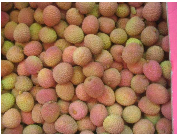
Litchis from Madagascar marked by sulphur.