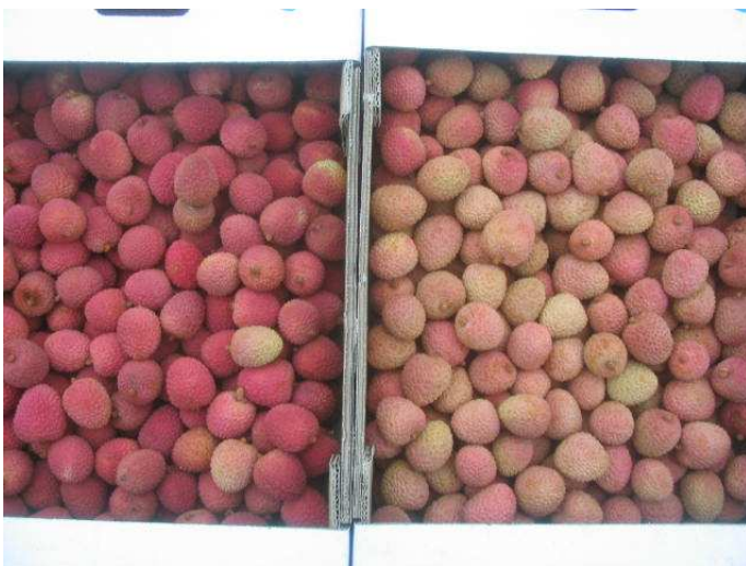
Difference in colour between boxes at the top of pallets and subjacent boxes.