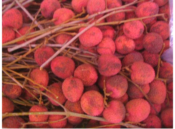
Litchis from Reunion on stem of poor quality. Strong oxidation of the shell. Important discount at sales level.