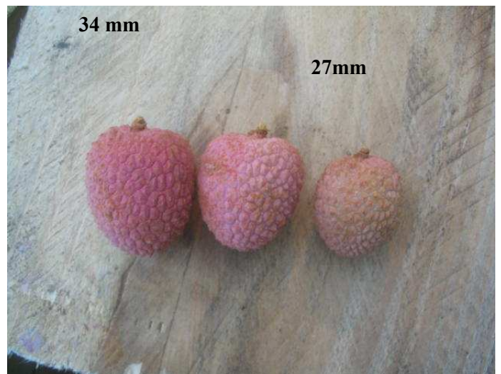
Difference in size for litchis from Madagascar