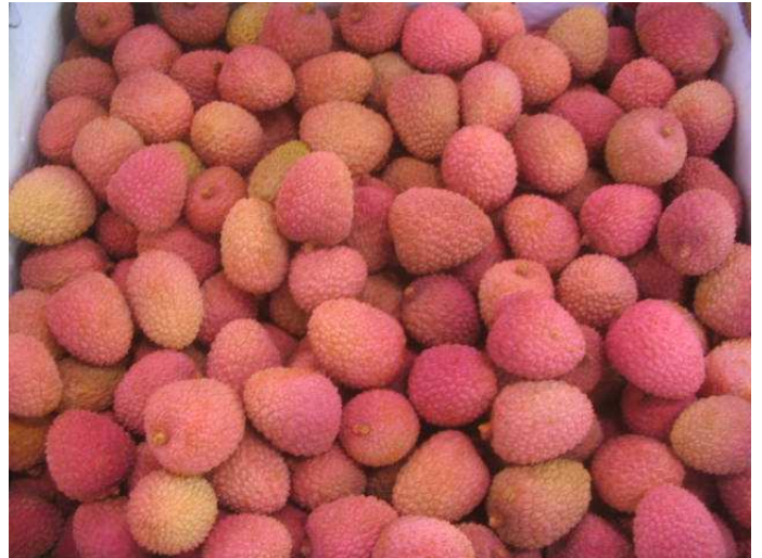
Litchis from Madagascar attractive in colour and presentation.