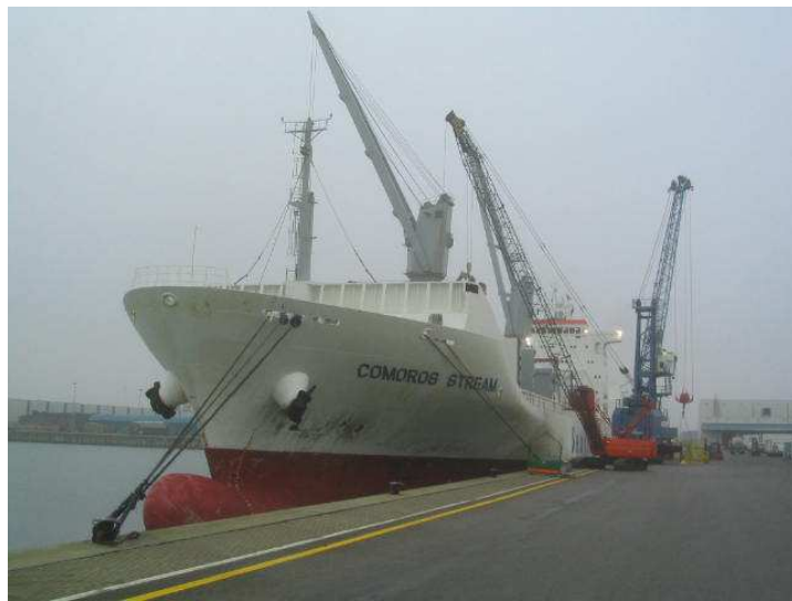
Unloading of the « Comoros Stream » at Vlissingen 15th and 16th December.