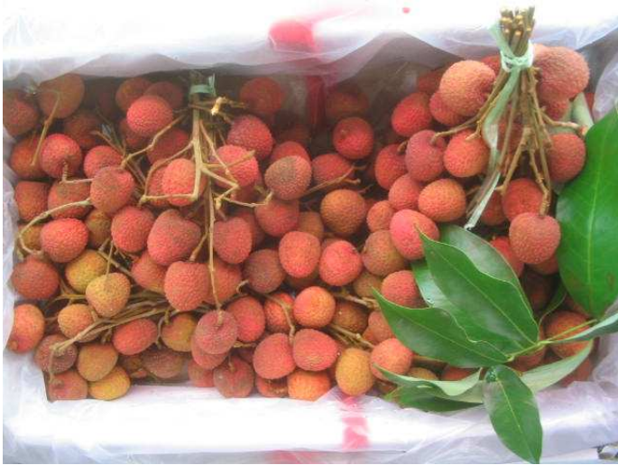
Litchis from Mauritius presented in bunch. Beginning of oxidation of fruits.