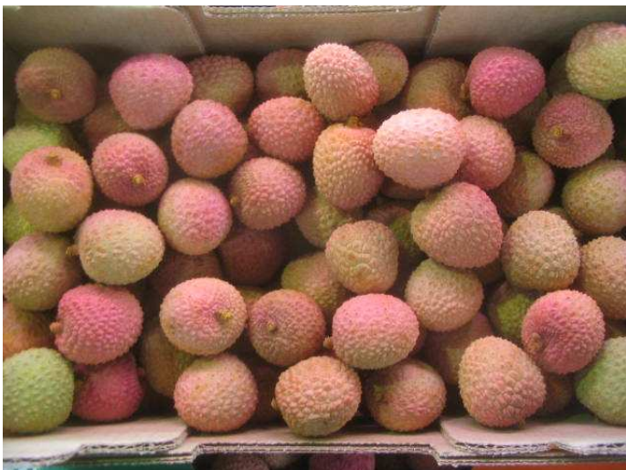
Litchis from South Africa (by container) good in size but mixed in colour depending on boxes.