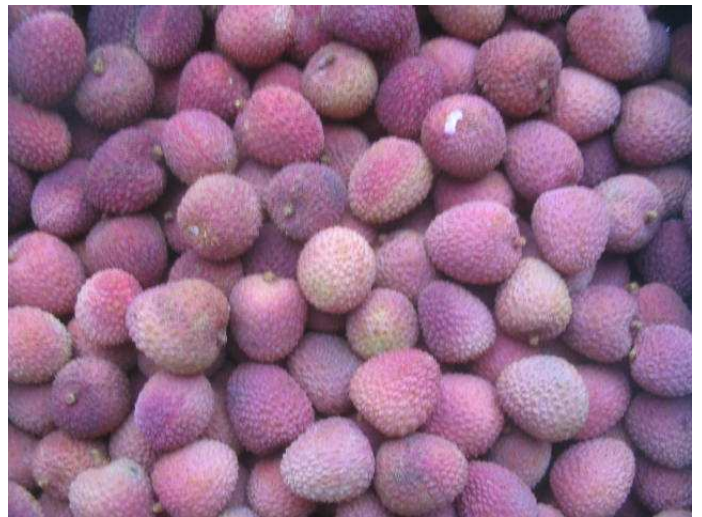
Colour and oxidation more or less stressed for litchis from Madagascar.