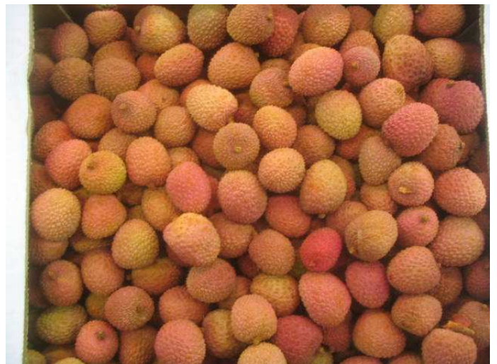
Litchis from Madagascar dull in aspect with progressive indurations of the shell. Old fruits.