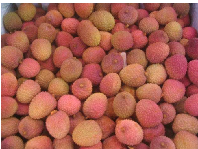
Litchis from Madagascar mixed in colour and freshness.