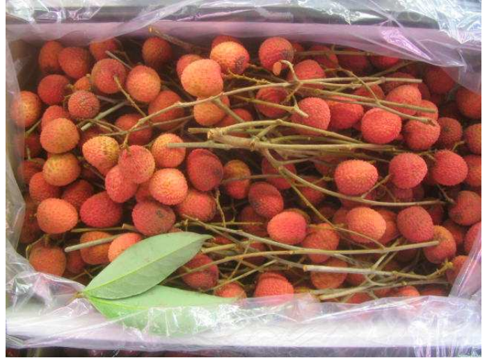
Litchis from Mauritius of satisfactory quality.