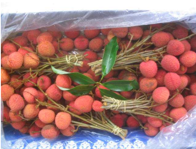
Litchis from Reunion presented in bunch of satisfactory quality.