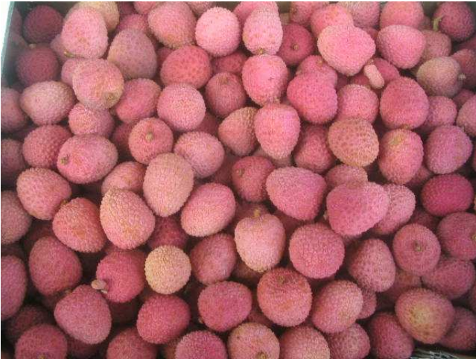
Standard quality litchis. Attractive colour