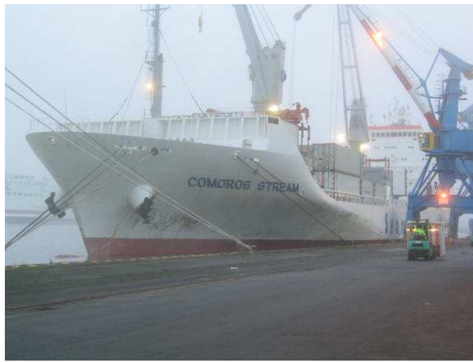
Docking of the « Comoros Stream » at St Nazaire