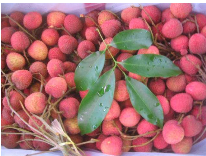
On stem litchis from Mauritius. Satisfactory quality