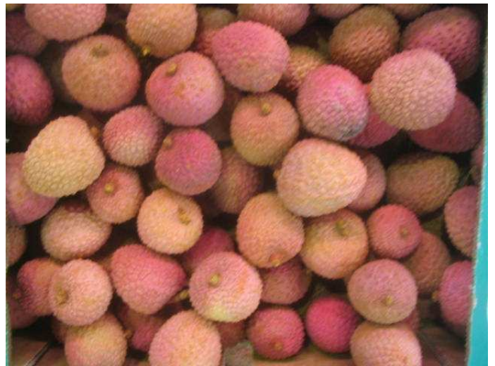
Litchis from Madagascar on the Rungis Market in the middle of the week. Colour and size are mixed