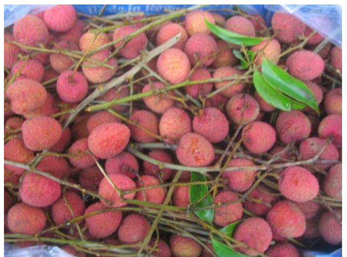
On stem litchis from Reunion. Fruits lacking freshness.