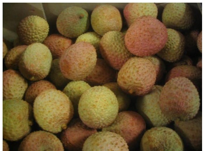
Air freighted litchis from South Africa pale in colour. Advanced maturity of some fruits.