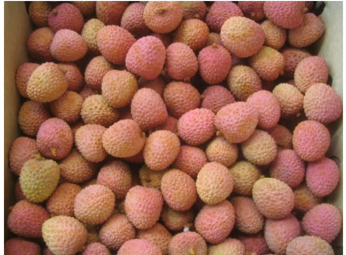
Sea freighted litchis from Madagascar mixed in colour and size.