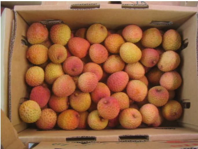
Sulphured air freighted litchis from Mauritius of satisfactory.