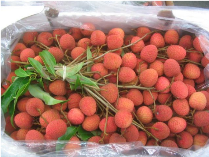
On stem litchis from Mauritius of satisfactory quality.