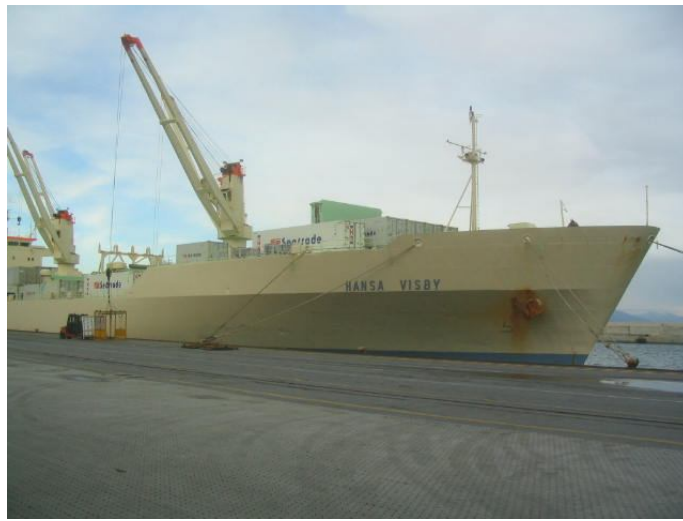
Docking of the Hansa Visby at Vado