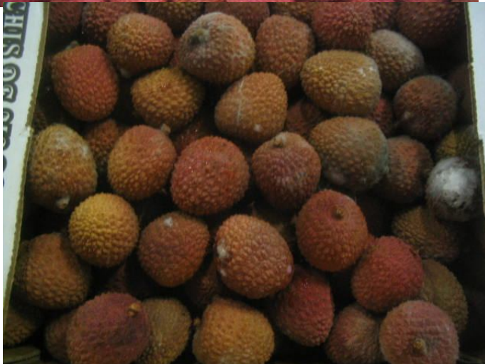
Limited mould stains on sea freighted litchis from Madagascar.