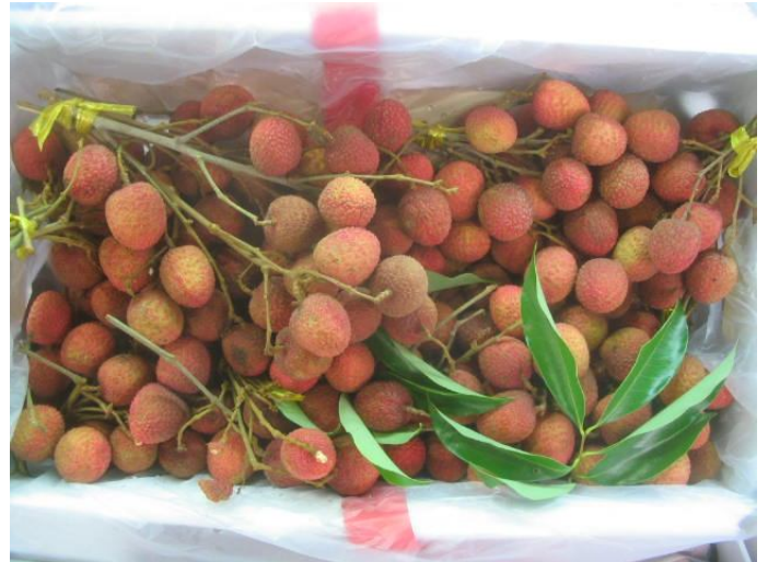
Bunch litchis from Mauritius. Fruits lacking freshness.