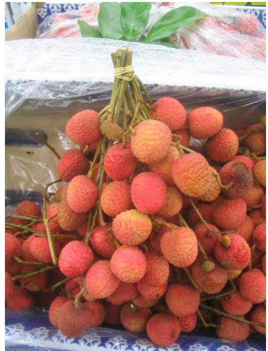
On stem litchis from Reunion presented in bunch.