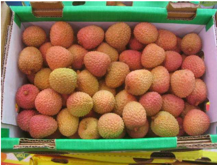
Litchis from Madagascar of satisfactory quality.