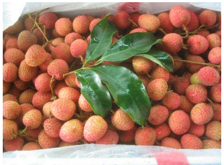
Litchis from Mauritius of satisfactory quality.