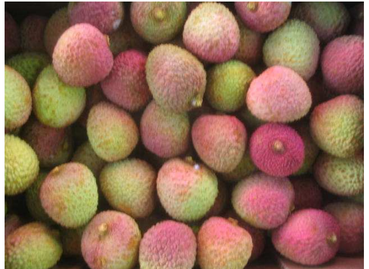
Not so attractive litchis from South Africa mixed in colour.