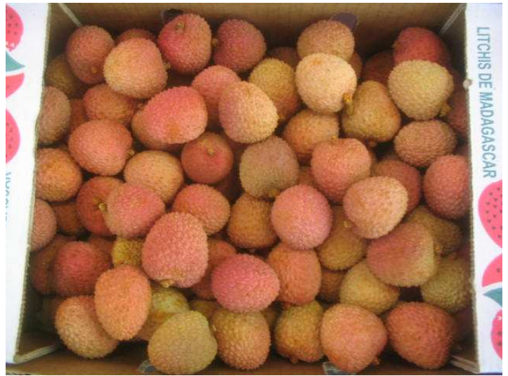
Litchis from Madagascar of homogeneous quality.