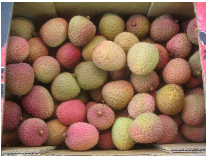
Litchis from South Africa of homogeneous quality.