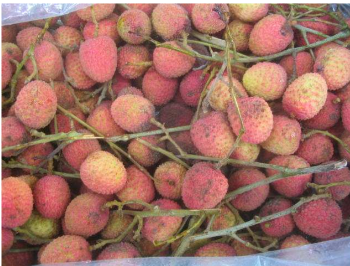
On stem litchis from Mauritius with oxidation stains.