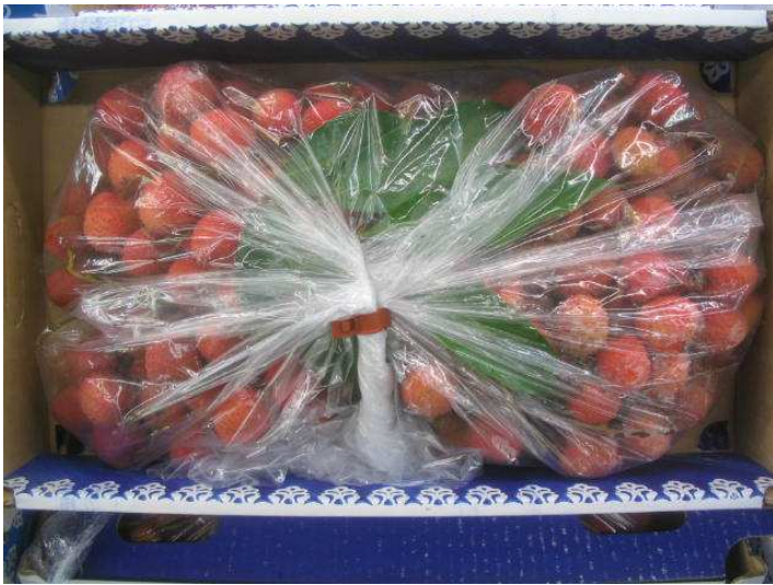
Fresh litchis from Reunion in 5/6kg boxes.