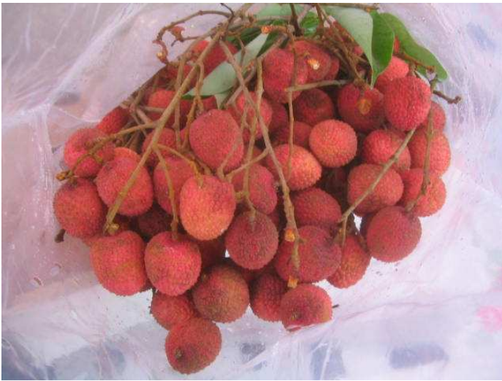
On stem litchis from Madagascar. Satisfactory quality.