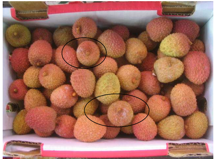
Litchis from Madagascar with stains of mould.