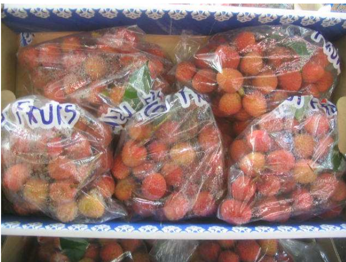
Fresh litchis from Reunion packed in 1 kg bags (5 bags per box).