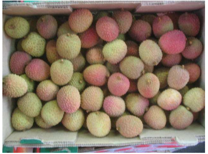
Litchis from South Africa of poor colour and dull aspect.