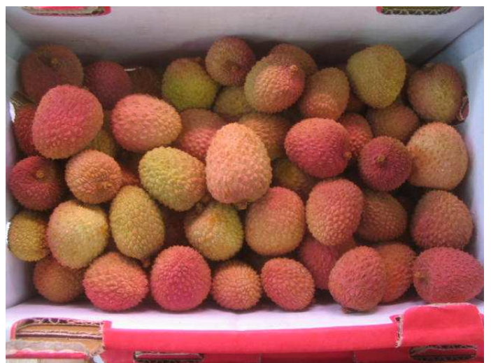
Litchis from Madagascar of satisfactory quality.