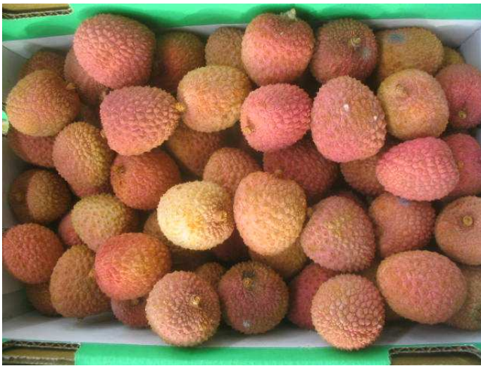
Litchis from Madagascar of homogeneous colour and size.