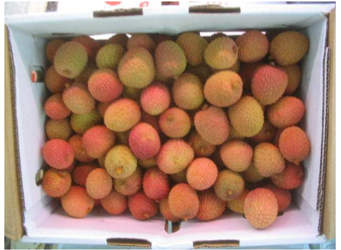
Litchis from Mauritius of mixed quality (in size and colour).