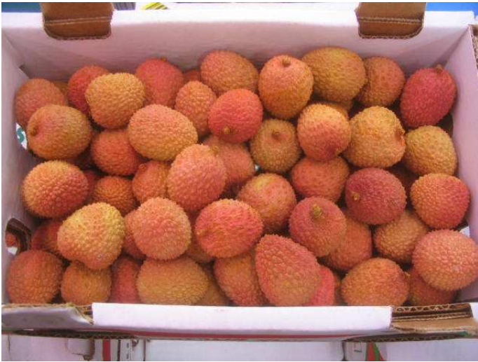
Litchis from Mauritius of homogeneous quality.