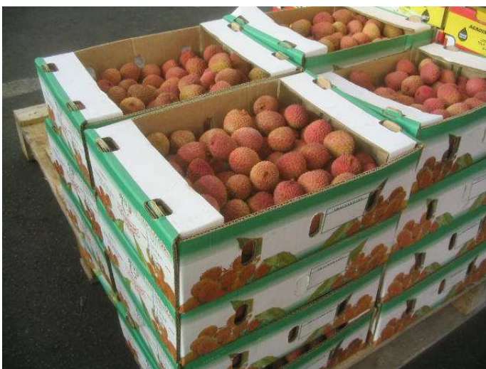
Litchis from Madagascar in tray boxes.