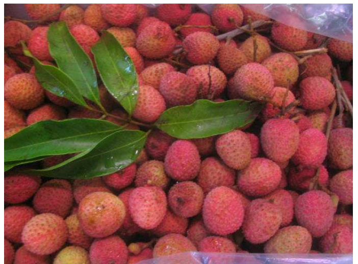
On stem litchis from Reunion. Mixed colour and size. First signs of oxidation on some fruits.