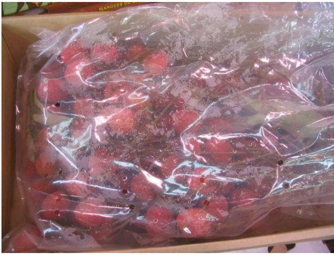
On stem litchis from Madagascar. Packaging is un adapted to fruits.