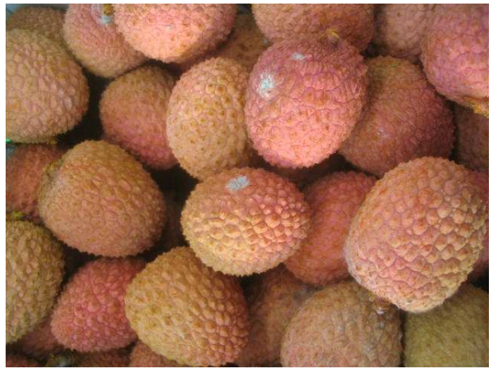
Litchis from Madagascar affected by mould.