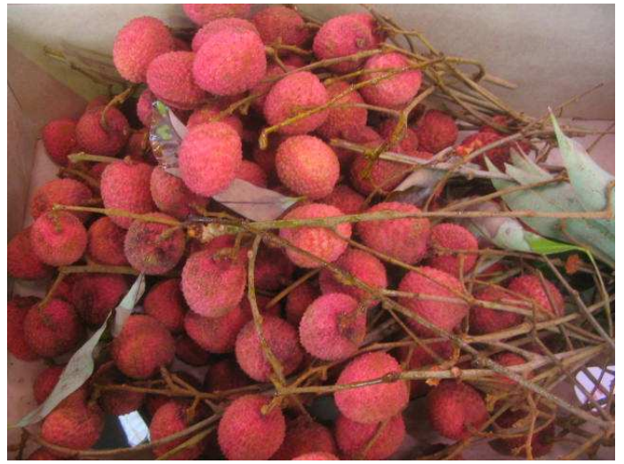
On stem litchis from Madagascar. Good size beginning of oxidation process on shell. Good eating quality