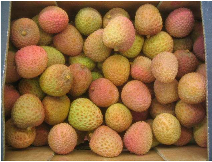
Litchis from South Africa homogeneous in colour and size.