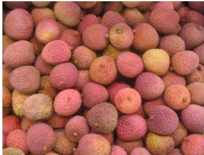
Litchis from Madagascar of mixed aspect.