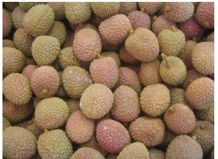
Dried litchis from Madagascar with mould stains.