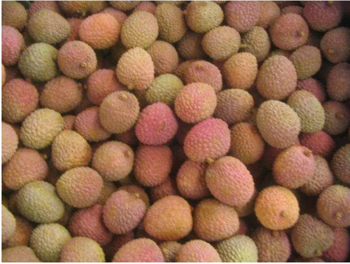
Old litchis from Madagascar (shell indurations dull in aspect mixed in colour).