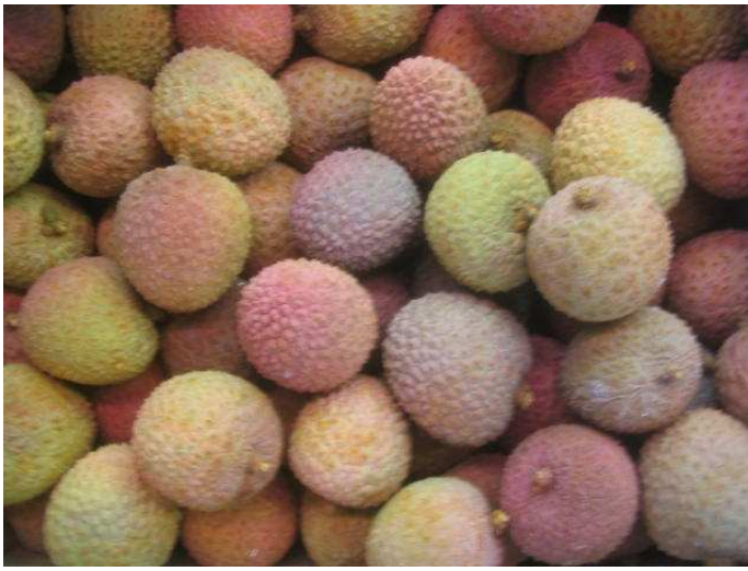
Litchis from South Africa of mixed colour and ripeness.