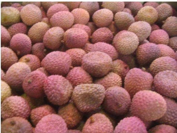
Poor quality litchis from Madagascar Blown fruits smashed or over mature fruits.