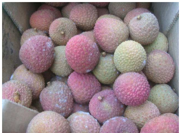
Litchis from South Africa with mould stains