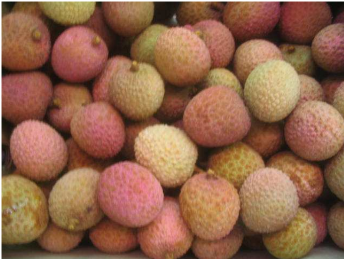
Standard quality litchis from South Africa (sulphur burns).