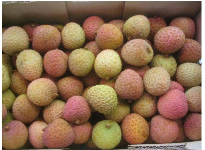
Litchis from South Africa mixed in colour. Several sulphur burns.