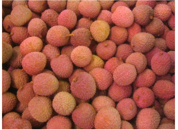
Litchis from Madagascar mixed in quality but of good aspect.