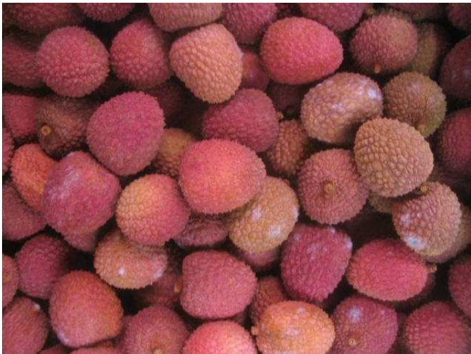
Litchis from Madagascar. Important stains of mould.