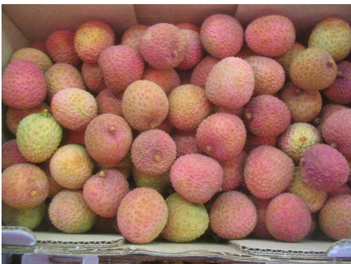
Litchis from South Africa of satisfactory quality. Mixed colour.