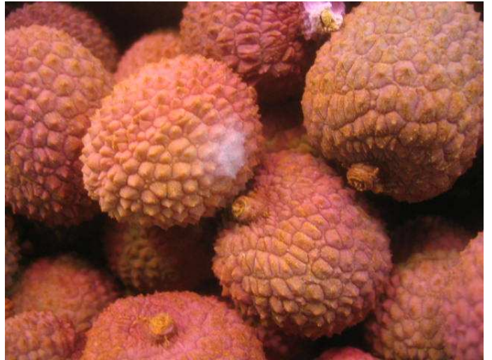
Litchis from Madagascar. Stains of mould beginning to show.