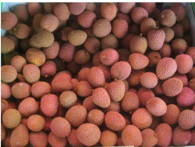
Litchis from Madagascar beginning desiccation.