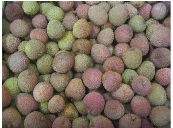
Old fruits from Madagascar with rather poor colour.