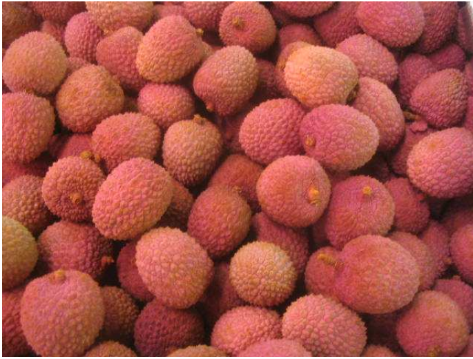
Litchis from Madagascar of standard quality. Fresh of good colour but mixed in size.