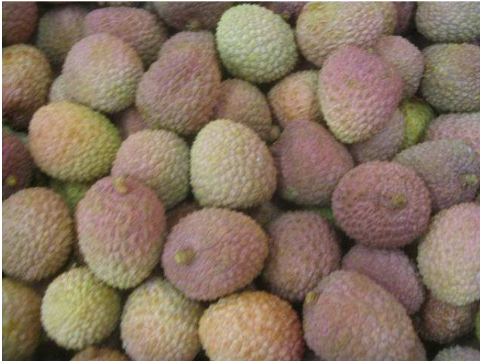
Old fruits from Madagascar. Progressive indurations of shells.