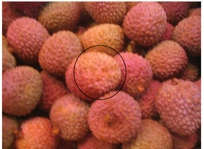
Litchis from Madagascar. « Blown » fruits.