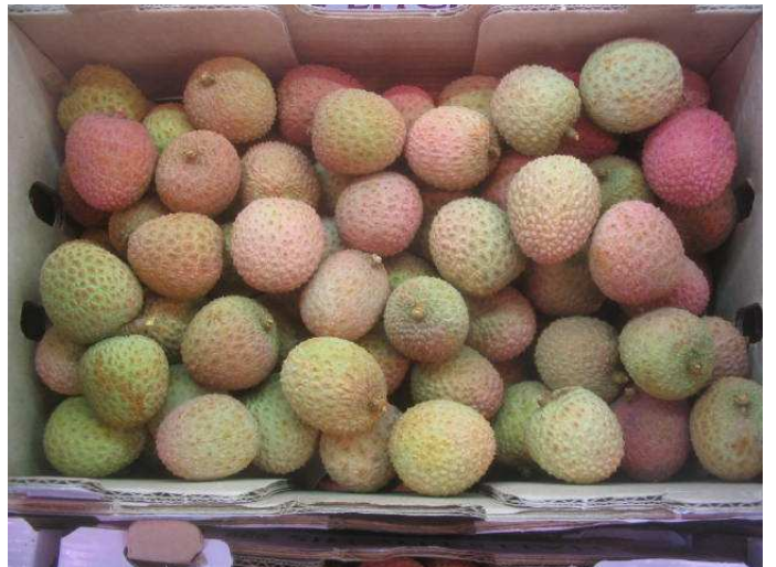
Litchis from South Africa of poor colour.