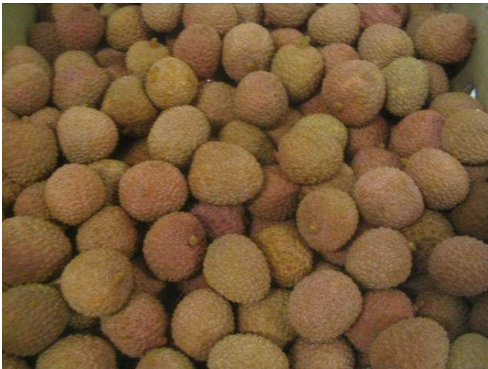
Litchis from Madagascar of dull aspect and lacking freshness.