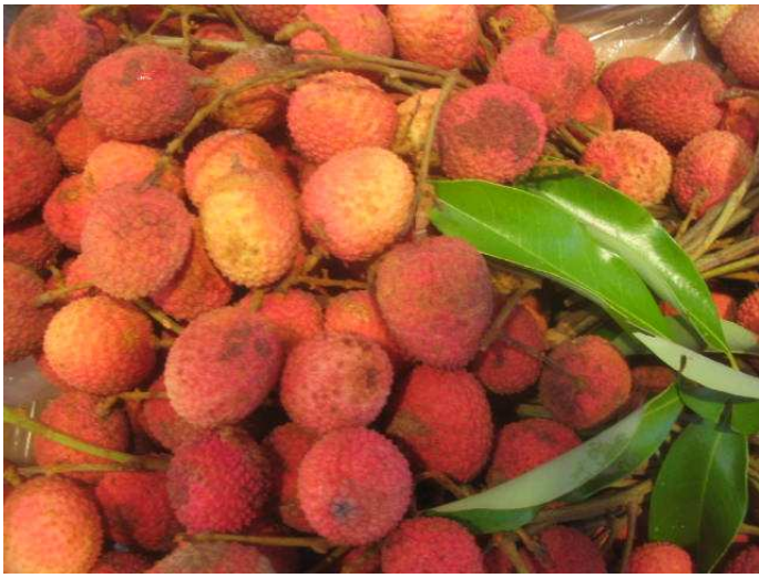
On stem litchis from Reunion presenting rapid stains of oxidation on the shell.