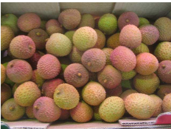
South African litchis of mixed colour