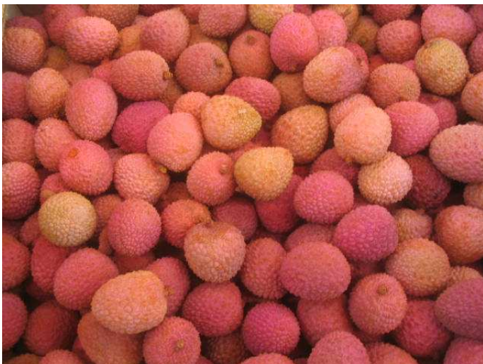
Fresh litchis from Madagascar.