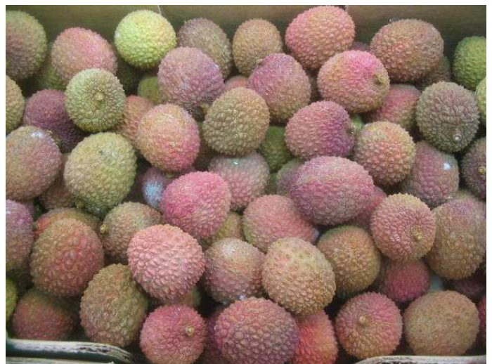
Litchis from South Africa with mould stains.