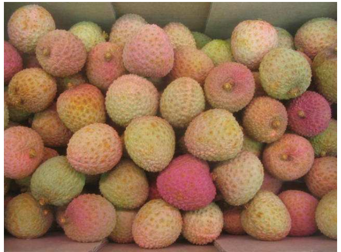
Litchis from South Africa of good quality but mixed in colour.