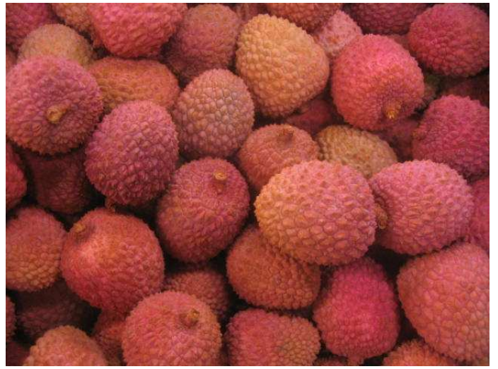
Litchis from Madagascar of standard quality.