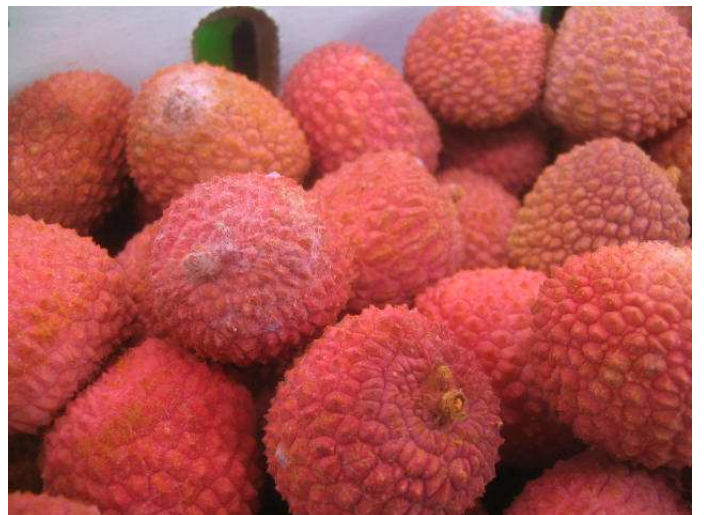
Litchis from Madagascar with mould stains.