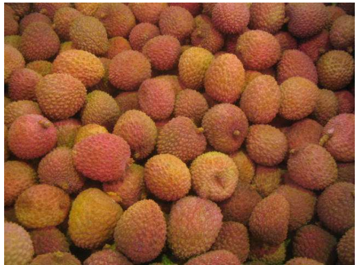
Old litchis from Madagascar, of dull aspect and brownish colour.