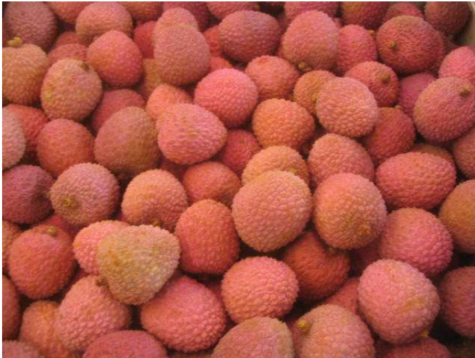
Litchis from Madagascar of standard quality. Fruits becoming dull.