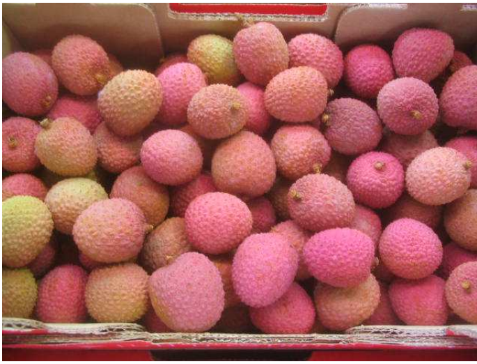
Litchis from South Africa of rather good quality (average size and colour).