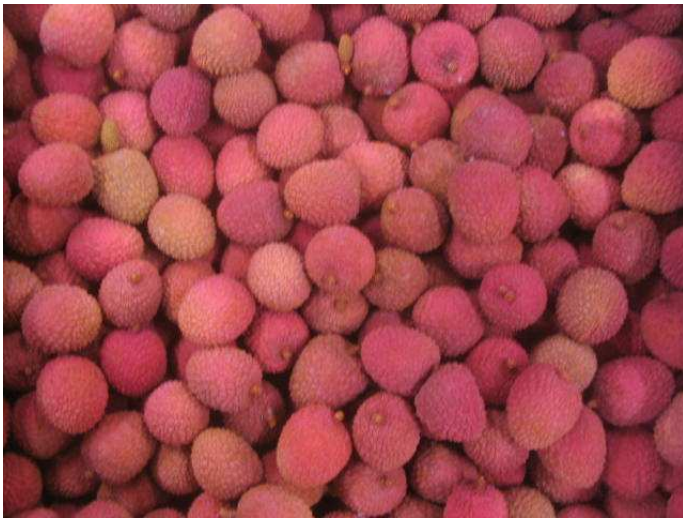
Ageing litchis from Madagascar dull in aspect.