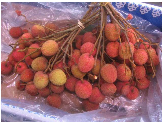
On stem litchis from Reunion presented in bunches.