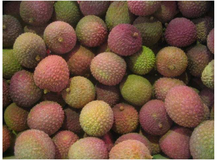
Mixed quality litchis from South Africa . Unattractive colour.