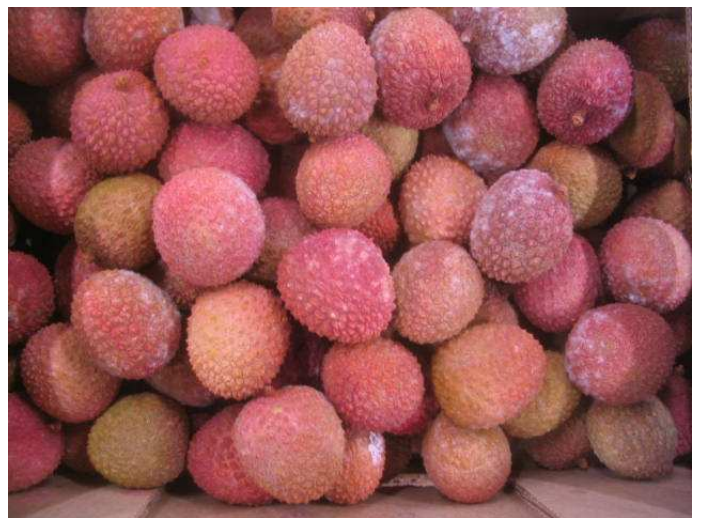
Litchis from South Africa presenting attacks of mould.