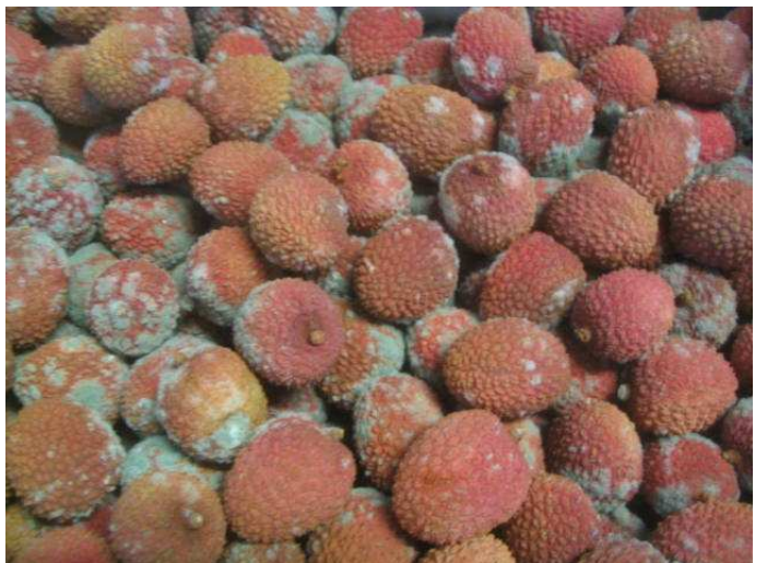
Litchis from Madagascar unfit for consumption.