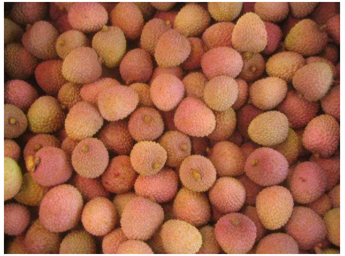
Litchis from Madagascar. Small sized fruits.