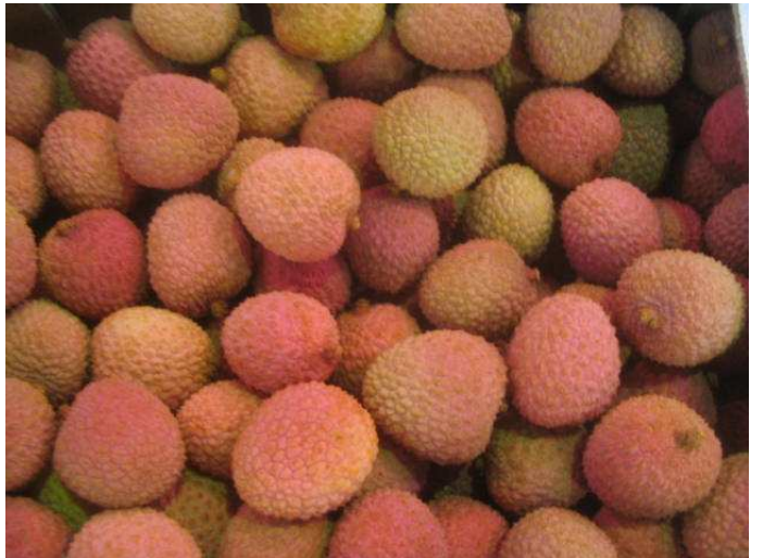
Litchis from Madagascar mixed in size and colour.